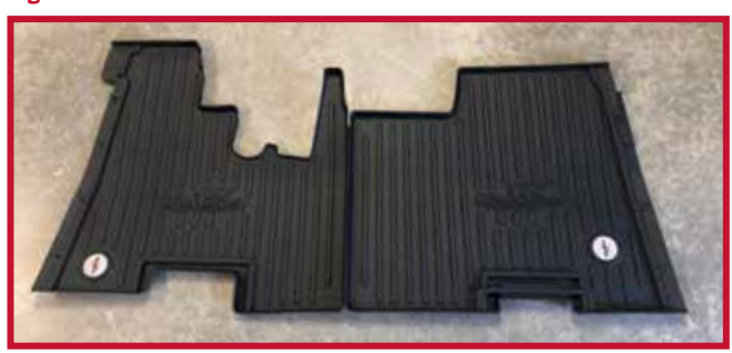
Figure 2 - Floor Mat Kit 105188

Kit 105188 shown in Figure 2 is compatible with 2006-2021 Kenworth T270 & T370 trucks and 2002-2006 Kenworth T300 trucks with automatic transmission and passenger bench seat or passenger air ride seat.