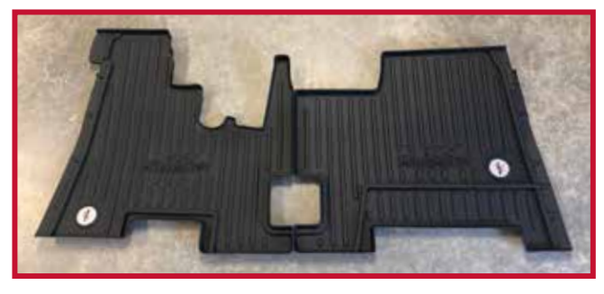
Figure 3 - Floor Mat Kit 105189

Kit 105189 shown in Figure 3 is compatible with 2006-2021 Kenworth T270 & T370 trucks and 2002-2006 Kenworth T300 trucks with manual transmission and passenger storage box or passenger battery box.