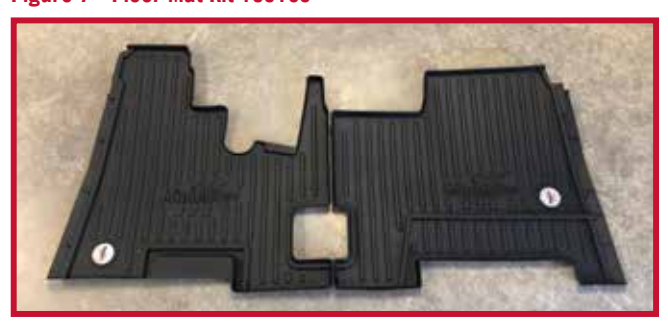
Figure 7 - Floor Mat Kit 105193

Kit 105193 shown in Figure 7 is compatible with 2002-2006 Kenworth T600, T800 & W900 trucks with manual transmission and passenger storage box or passenger battery box.*