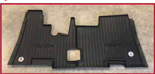
Figure 8 - Floor Mat Kit 105194

Kit 105194 shown in Figure 8 is compatible with 2002-2006 Kenworth T600, T800 & W900 trucks with manual transmission and passenger bench seat or passenger air ride seat.*