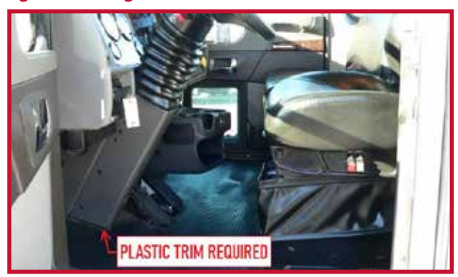
Figure 9 - Steering Column Fitment

*Must have plastic trim around steering column per Figure 9.