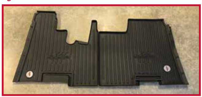
Figure 6 - Floor Mat Kit 105192

Kit 105192 shown in Figure 6 is compatible with 2002-2006 Kenworth T600, T800 & W900 trucks with automatic transmission and passenger bench seat or passenger air ride seat.*