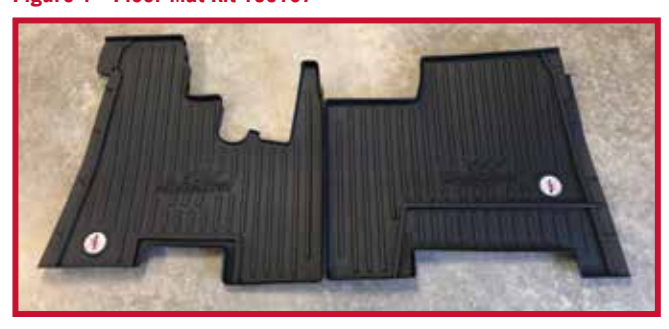
Figure 1 - Floor Mat Kit 105187

Kit 105187 shown in Figure 1 is compatible with 2006-2021 Kenworth T270 & T370 trucks and 2002-2006 Kenworth T300 trucks with automatic transmission and passenger storage box or passenger battery box.