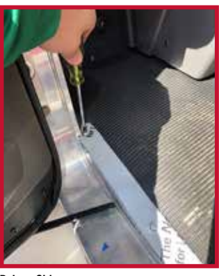
Figure 14 - Driver/Passenger Side Screw Location