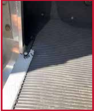
Figure 15 - Retention Hook Orientation

• Locate the retention hooks provided in the floor mat kit. Insert the screw through the hole in the retention hook and replace the screw into the trim. Tighten the screw with the hook oriented towards the fire wall on the driver side and towards the rear of the truck on the passenger side as shown in figure 15.