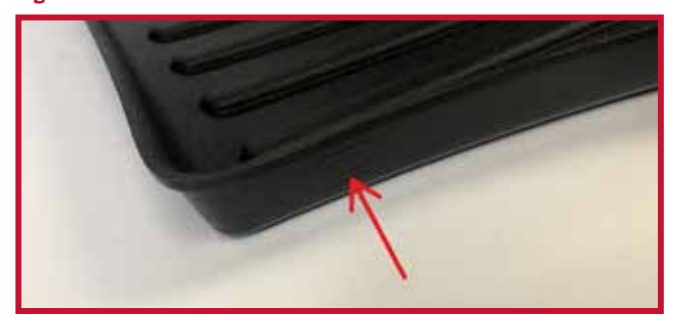
Figure 16 – Alternate Retention Hook Hole Location

• The hooks will be located on the doghouse trim panel as shown in figure 17.