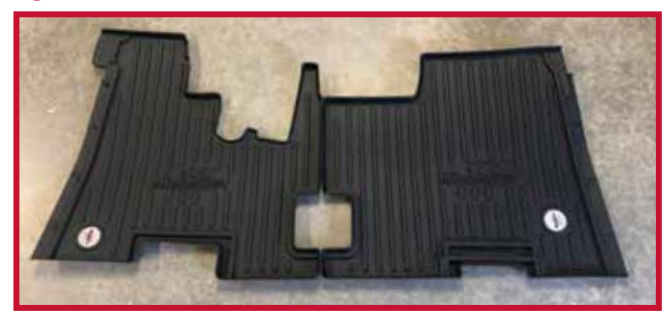
Figure 4 - Floor Mat Kit 105190

Kit 105190 shown in Figure 4 is compatible with 2006-2021 Kenworth T270 & T370 trucks and 2002-2006 Kenworth T300 trucks