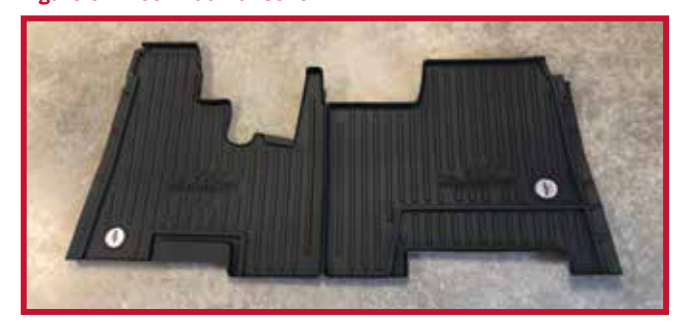
Figure 5 - Floor Mat Kit 105191

Kit 105191 shown in Figure 5 is compatible with 2002-2006 Kenworth T600, T800 & W900 trucks with automatic transmission and passenger storage box or passenger battery box.*