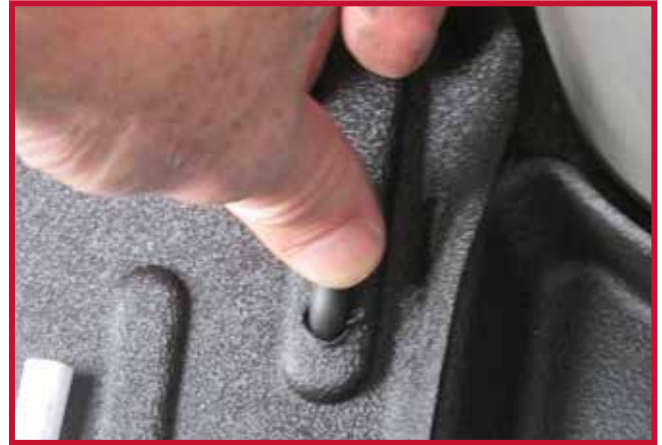
Figure 7 - Apply Pressure to the Hook

17. For optimal adhesion do not disturb the hook for a period of 20 minutes after installation. Figure 8 below shows the properly installed driver mat and hook.