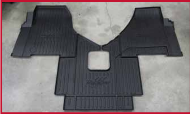
Figure 1 - Kit 103738 Contents