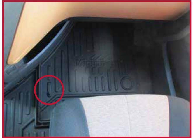
Figure 10 - Passenger Mat Retention Hook Location

23. Prior to operating the vehicle, read the Safety Instructions for Vehicle Operation.