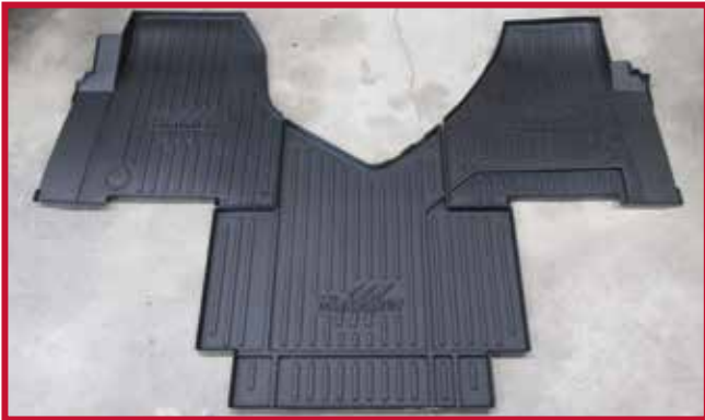
Figure 2 - Kit 103739 Contents