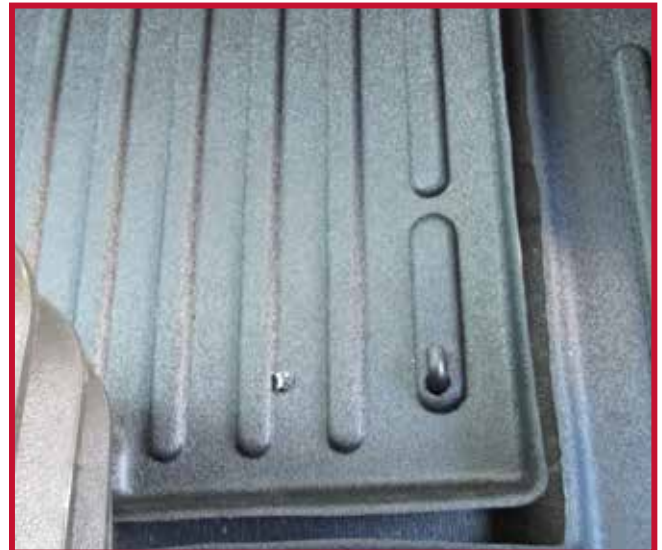
Figure 8 - Driver Mat Hook Installation

18. Pull the driver mat toward the rear of the truck to confirm that the hook is fully engaged into the mat and that the hook is adhered to the floor. If the hook is not functioning properly or the mat cannot be securely installed, do not use a Minimizer floor mat on the driver side of the vehicle.