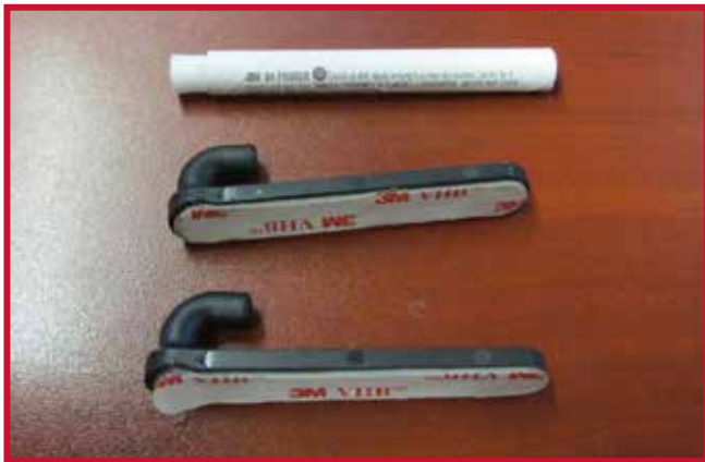
Figure 6 - Retention Hook and Primer 94

8. Insert one hook through the hole at the right edge of the driver mat. The hook should fit flush with the underside of the driver mat.