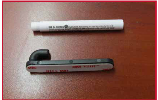
Figure 8 - Retention Hook and Primer 94

9. Insert the hook through the hole at the right edge of the driver mat as shown in Figure 9. The hook should fit flush with the underside of the driver mat.