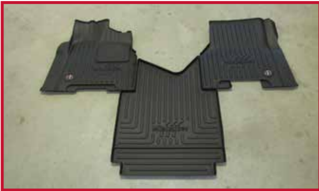
Figure 2 - Kit FKFRTL3AB Contents