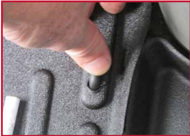
Figure 10 - Apply Pressure to the Hook

18. For optimal adhesion do not disturb the retention hook for a period of 20 minutes after installation. Figure 11 below shows the properly installed driver mat and hook.