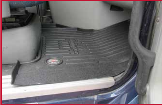
Figure 5 - Passenger Mat Trimmed and Installed with EzyRider Seat

7. Test fit the driver mat in the truck. The driver mat is designed to fit underneath the throttle pedal. To install the driver mat, lift up the heel portion of the throttle pedal and slide the front of the floor mat underneath the pedal. Confirm that the mat is pushed all the way forward so it rests against the fire wall. Figure 6 below shows the driver mat installed in a truck with an OEM seat.