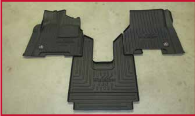
Figure 1 - Kit FKFRTL3MB Contents