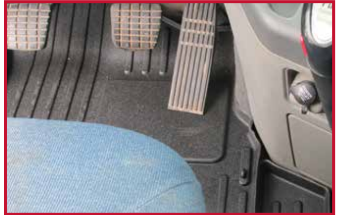
Figure 11 - Properly Installed Driver Mat and Hook

19. Pull the driver mat toward the rear of the truck to confirm that the hook is fully engaged into the mat and that the hook is adhered to the floor. If the hook is not functioning properly or the mat cannot be securely installed, do not use a Minimizer floor mat on the driver side of the vehicle.