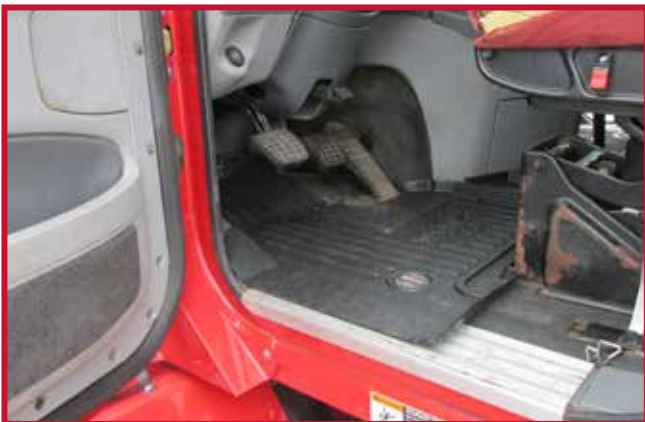
Figure 6 - Driver Mat Fit with OEM Seat Base

Note: When installing in trucks equipped with an EzyRider driver seat the floor mat material behind the raised rib will need to be trimmed away with a utility knife as shown in Figure 7. The raised rib is designed to act as a knife guide and contain liquid. Trucks that are outfitted with aftermarket seats or have had the seat position altered may also require hand trimming along the raised rib.