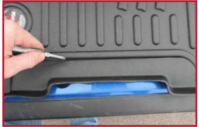
Figure 7 – Driver Mat Trim for Installation With Ezy Rider Seat or Aftermarket Seat.

8. Inside the package with the installation instructions, locate a black plastic retention hook as well as a white tube of Primer 94 as shown in Figure 8.