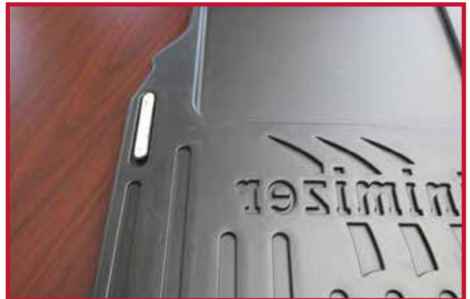
Figure 9 - Hook Inserted in Driver Mat

10. Once the hook is in place, let the driver mat and hook rest on the truck floor.