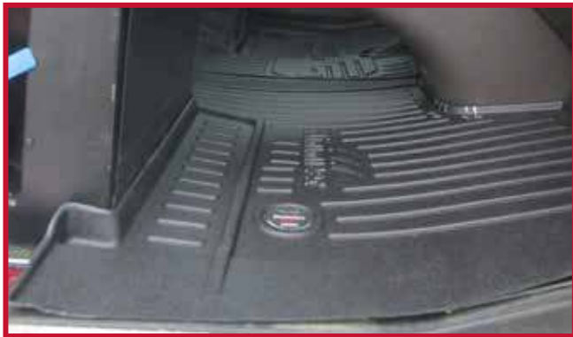
Figure 13 – Passenger Mat Fit

• If the truck is equipped with a passenger seat with under seat battery storage as shown in Figure 14, the passenger mat must be trimmed in order to fit properly.