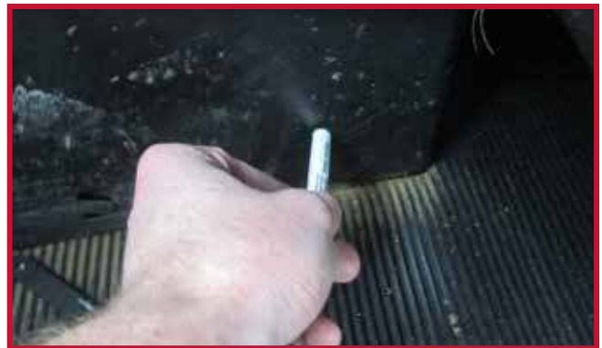
Figure 11 – Apply Primer to Seat Base

• Allow the Primer 94 to dry on the seat base surface for 5 minutes.