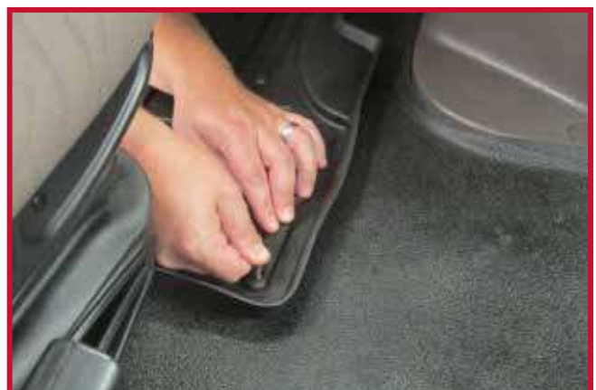
Figure 12 – Apply Pressure to Hook

• For optimal adhesion, do not disturb the hook for a period of 20 minutes after installation.