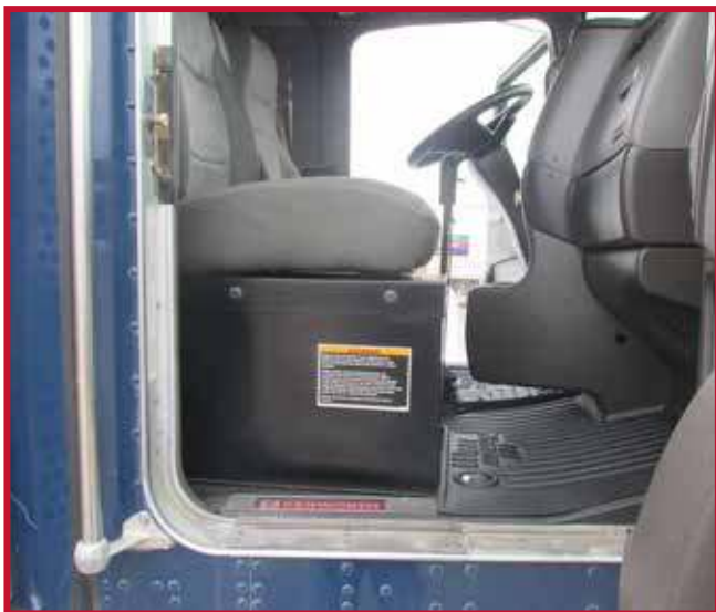
Figure 14 – Passenger Seat Battery Box with Trimmed Floor Mat

• Use a sharp utility knife to cut the mat. Follow along the inside edge of the tall rib and preserve the rib for liquid containment purposes. See Figure 15.