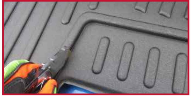
Figure 15 – Trimming Passenger Mat

13. Install the passenger mat retention hook. Apply primer to the area shown in Figure 16 and repeat step 7b above to properly attach the hook to the plastic door threshold. Figure 17 shows a proper hook installation.