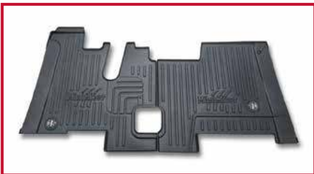
Figure 4 – Floor Mat Kit #100889