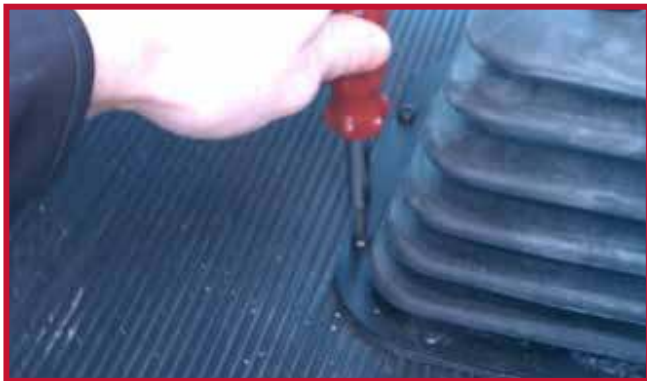
Figure 8 – Remove Screw from Shifter Boot

• Insert the screw through the hole in the retention hook as shown in Figure 9.