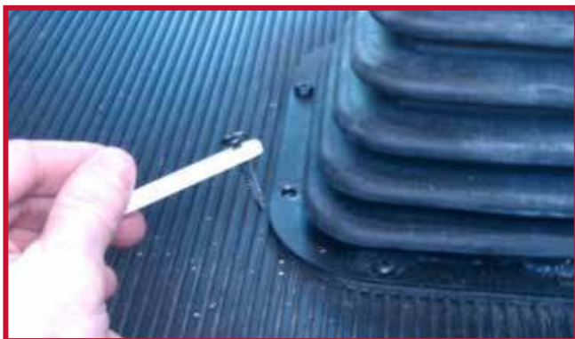
Figure 9 – Install Hook on Existing Screw

• Replace the screw in the original hole and tighten. Orient the floor mat hook so it points toward the front of the truck.