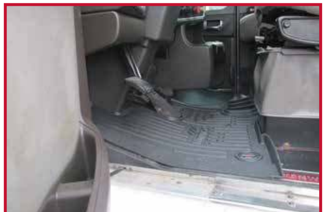
Figure 7 – Driver Mat Fit