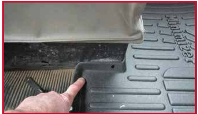
Figure 10 – Driver Mat Hook Location

• The retention hook will be attached to the right side of the driver seat base via a slotted hole in the vertical wall of the driver mat as shown Figure 10.