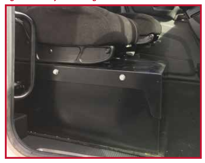
Figure 8 - Battery Box Passenger Seat Base

• Raised trim lines are available to fit the passenger seat with battery box seat base as shown in Figure 9.