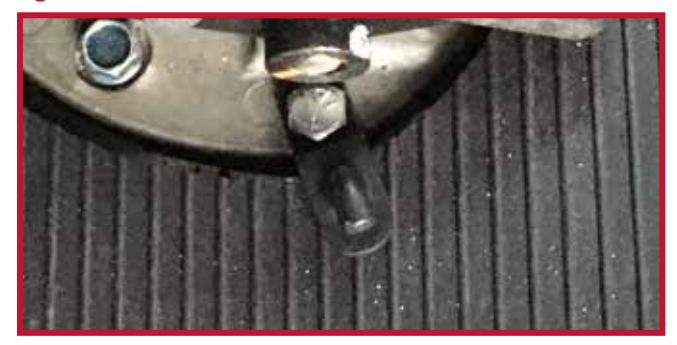
Figure 13 - Retention Hook & Hardware

11. Place the driver mat in the truck and attach mat to the retention hook.