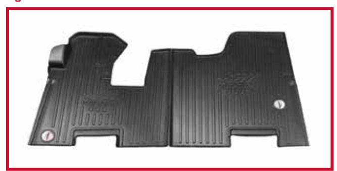
Figure 1 - Floor Mat Kit 105036