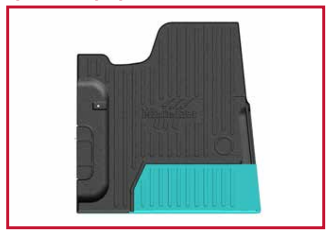
Figure 9 - Trimming Diagram

• Trim the teal shaded area of the floor mat along the raised rib to fit the battery box seat base.