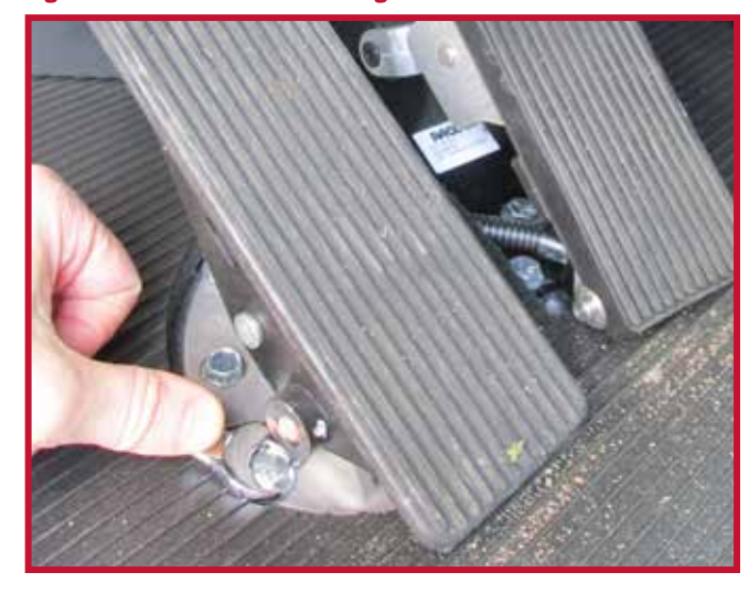
Figure 12 - Brake-Pedal Mounting Bolt

8. Figure 12 below shows the location of the brake-pedal mounting bolt where the driver mat retention hook will attach to the truck floor.