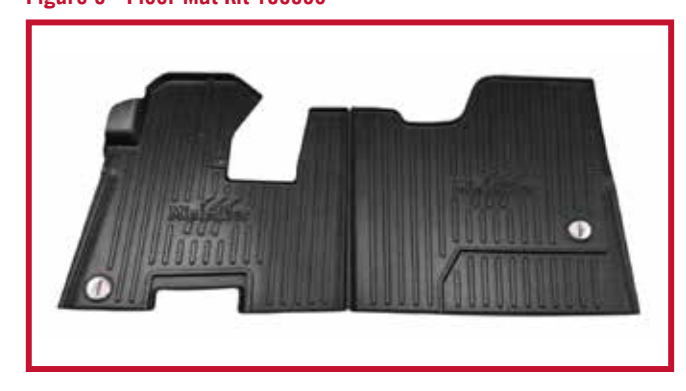
Figure 6 - Floor Mat Kit 105038