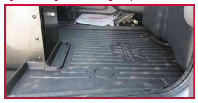
Figure 2 - Passenger Seat with Storage Compartment

• Trim lines are available for the storage compartment seat base when located 27.25" behind the dash. The blue shaded area in Figure 3 is the area to be trimmed.