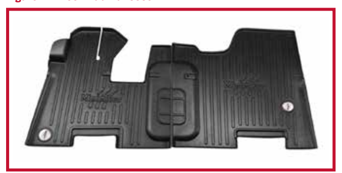
Figure 4 - Floor Mat Kit 105037

• The trim lines allow for fit of aftermarket passenger seats and the Minimizer Long Haul Series seat.