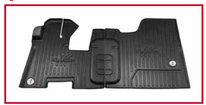
Figure 10 - Floor Mat Kit 105039

• Trim the teal shaded area of the floor mat along the raised rib to fit the battery box seat base.