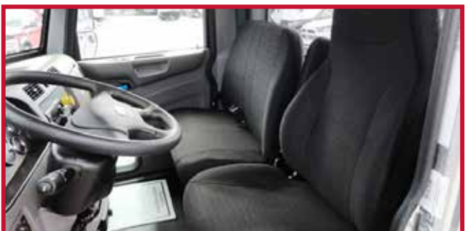
Figure 7 - Two-Man Bench Seat