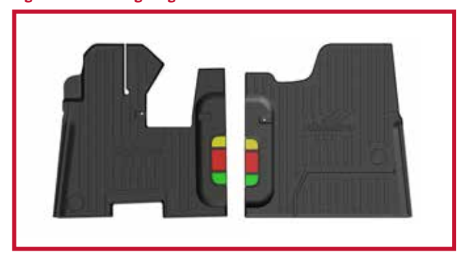
Figure 5 - Trimming Diagram