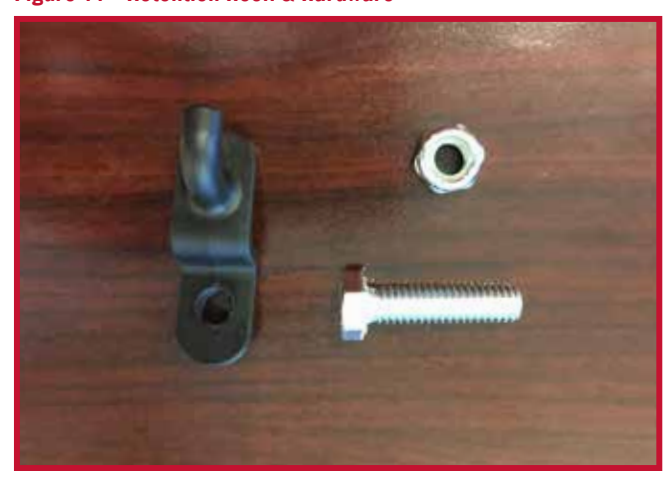
Figure 11 - Retention Hook & Hardware

8. Figure 12 below shows the location of the brake-pedal mounting bolt where the driver mat retention hook will attach to the truck floor.