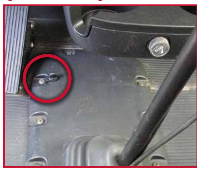
Figure 15 - Brake-Pedal Mounting Bolt