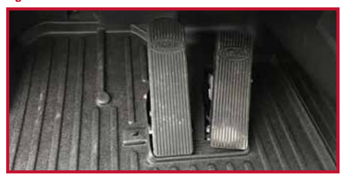
Figure 14 - Driver Mat Installed with Hook

11. Place the driver mat in the truck and attach mat to the retention hook.