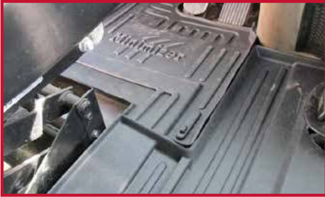
Figure 9 - Driver Mat Hook in Position

Mark the approximate position where the hook needs to be attached to the floor. Once the position is located, remove the driver mat from the truck.