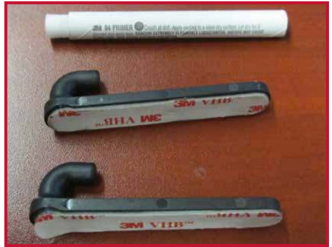
Figure 6 - Driver Side Electrical Enclosure & Floor Mat