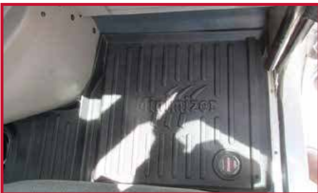
Figure 10 - Passenger Mat in Position

16. Position the passenger floor mat in the truck. Make sure the passenger mat is pushed all the way forward so the outside lip makes full contact with the doghouse trim panel and fire wall as shown in Figure 10.