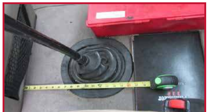
Figure 3 - Distance Measured from Doghouse to Gearshift