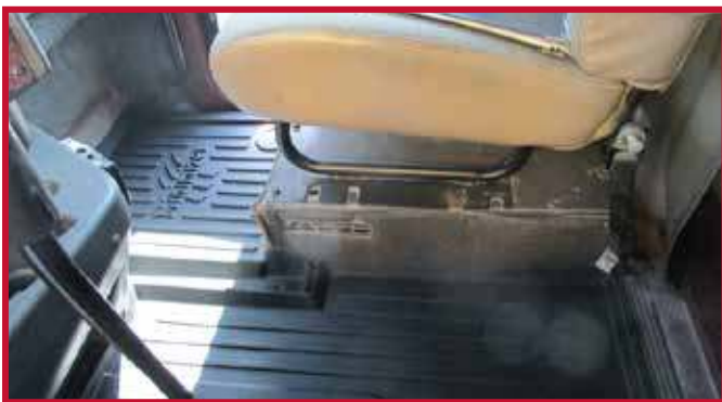
Figure 1 - Premium Interior (No Cup Holder)