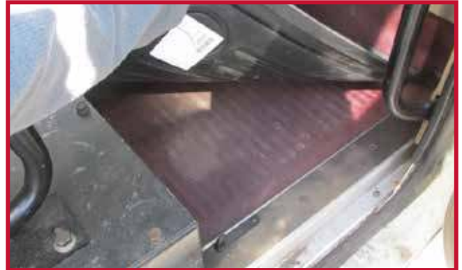
Figure 11 - Passenger Mat Hook in Position

18. Confirm that the retention hook is fully engaged into the driver mat and that the hook is adhered to the floor. If the driver mat retention hook is not functioning properly or the mat cannot be securely installed, do not use a Minimizer floor mat on the driver side of the vehicle.