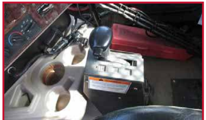
Figure 8 - Floor Mounted Control Tower

Note: Some older trucks with automatic transmissions are equipped with a control tower that is fastened to the floor as shown in Figure 8. Hand trimming of the center mat is required for compatibility with floor mounted control towers.