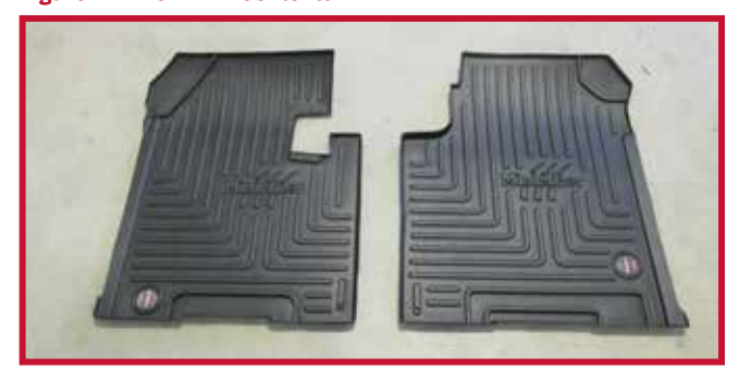
Figure 2 - FKSTAR2B Contents

Kit FKWS2B is compatible with 2012-2016 Western Star 4900SA, 4900FA, 4900SF, 4900SB.