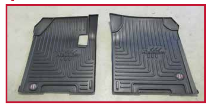
Figure 1 - FKSTAR1B Contents

Kit FKWS2B is compatible with 2012-2016 Western Star 4900SA, 4900FA, 4900SF, 4900SB.