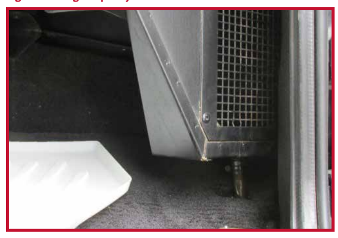
Figure 11 - High Capacity HVAC Unit

• For Western Star models 4900SA, 4900FA, 4900SB, 4900SF years 1998 - 2011 the yellow shaded area shown in Figure 12 will likely need to be hand trimmed along the raised rib at the time of installation. Test fit the mat before trimming to confirm.