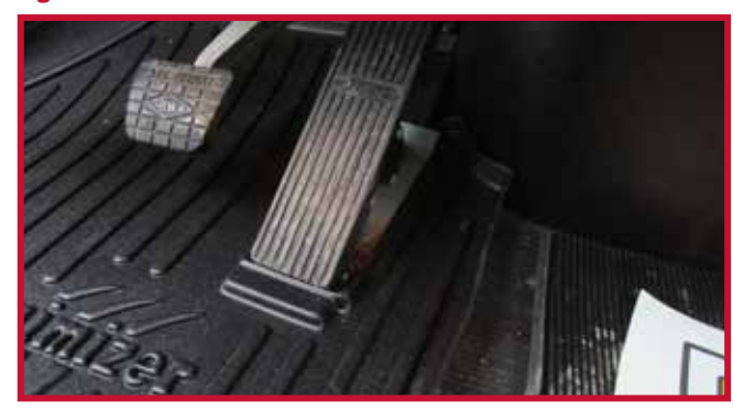
Figure 5 - FKSTAR3B Driver Mat Installation

• In some cases a steel or plastic electrical enclosure will be mounted on the floor area in the left front corner of the cab as shown in Figure 6. If the electrical enclosure is present, the left front portion of the driver mat will need to be hand trimmed along the raised rib. The area to trim is shaded red in Figure 7.