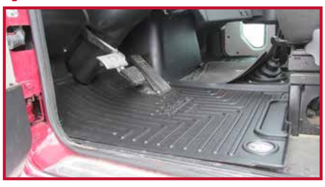
Figure 4 - Driver Mat Position