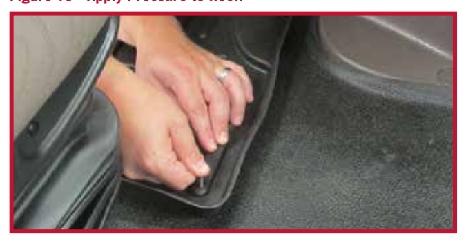
Figure 10 - Apply Pressure to Hook

15. Position the passenger mat in the truck. Make sure the passenger mat is pushed all the way forward so the outside lip makes full contact with the doghouse trim panel and fire wall.