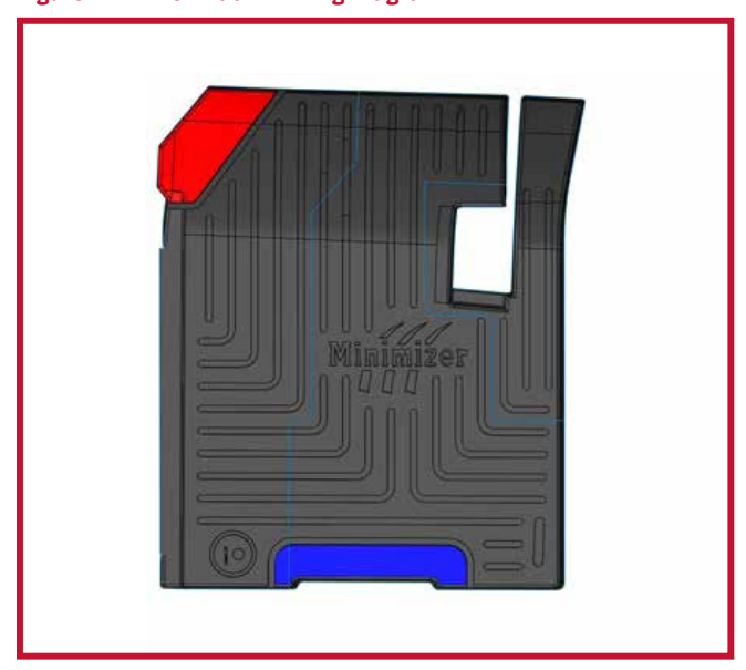
Figure 7 - Driver Mat Trimming Diagram

6. Inside the package with the installation instructions, locate two black plastic retention hooks and a white tube of Primer 94 as shown in Figure 8.