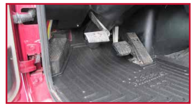
Figure 6 - Driver Side Electrical Enclosure & Floor Mat

• In some cases a steel or plastic electrical enclosure will be mounted on the floor area in the left front corner of the cab as shown in Figure 6. If the electrical enclosure is present, the left front portion of the driver mat will need to be hand trimmed along the raised rib. The area to trim is shaded red in Figure 7.