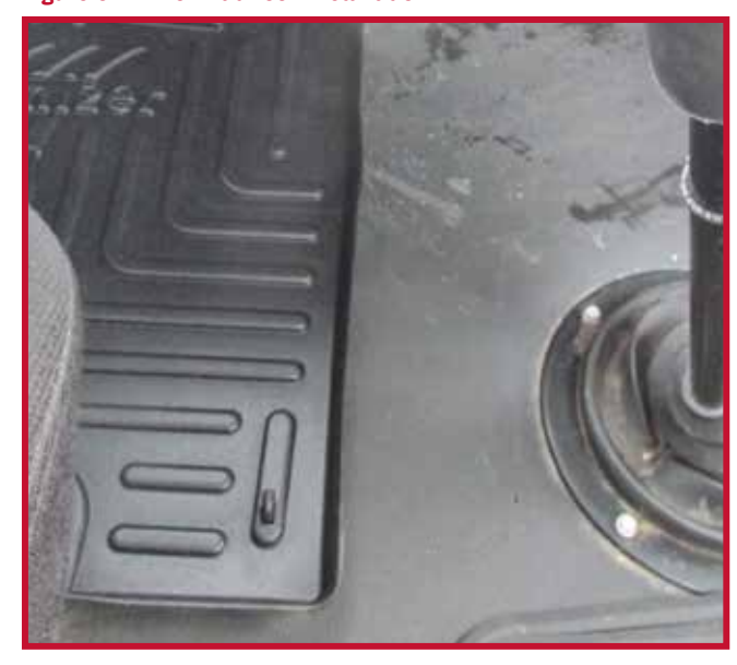
Figure 9 - Driver Mat Hook Installation

floor mat where the hook can be inserted into the mat. Follow the same cleaning and adhesion process that is outlined in steps 9-14. Another option is to attach the hook is to drill a hole in the seat base and use a machine screw. Screws are not provided in the kit.