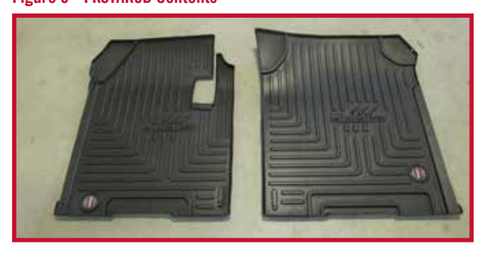
Figure 3 - FKSTAR3B Contents