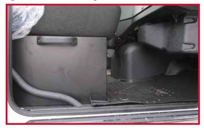
Figure 12 - Fixed Base Passenger Seat with Trimmed Mat

Note: The passenger floor mat is designed to accommodate both fixed seats and suspension seats. Trucks that are equipped with a fixed base passenger seat as shown in Figure 12 will need to be hand trimmed prior to installation. Aftermarket seats may also require hand trimming. There are two raised ribs molded into the passenger mat to act as trim guides. To confirm which line to trim along test fit the mat against the seat base. Use a sharp utility knife to trim along the outside edge of the rib. Preserve the rib for liquid containment.