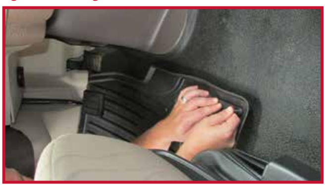
Figure 11 - Passenger Mat In Position

15. Position the passenger floor mat in the truck. Make sure the passenger mat is pushed all the way forward so the outside lip makes full contact with the doghouse trim panel and fire wall as shown in Figure 11.