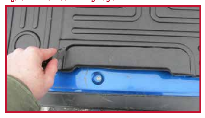
Figure 7 - Driver Mat Trimming Diagram

6. Inside the package with the installation instructions, locate two black plastic retention hooks and a white tube of Primer 94 as shown in Figure 8.