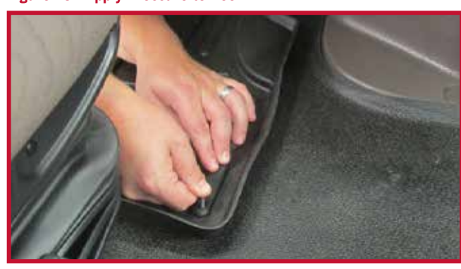
Figure 10 - Apply Pressure to Hook

15. Position the passenger floor mat in the truck. Make sure the passenger mat is pushed all the way forward so the outside lip makes full contact with the doghouse trim panel and fire wall as shown in Figure 11.