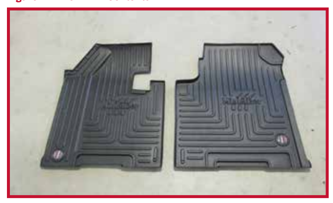
Figure 1 - FKSTAR4B Contents

Kit FKSTAR5B shown in Figure 2 is compatible with 2012-2016 Western Star Model 4700 equipped with the DD13 Engine and a driver side electrical tray. Refer to Figure 4 to identify the driver side electrical tray.