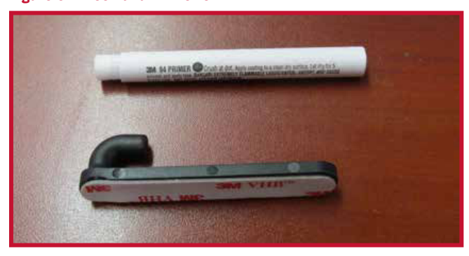
Figure 8 - Hook and Primer 94

6. Inside the package with the installation instructions, locate two black plastic retention hooks and a white tube of Primer 94 as shown in Figure 8.