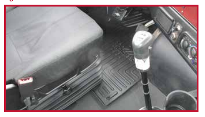
Figure 9 - Driver Mat Hook in Position

Mark the approximate position where the hook needs to be attached to the floor. Once the position is located, remove the driver mat from the truck.