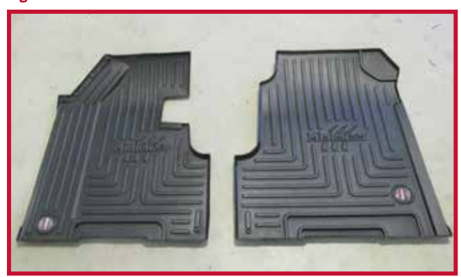
Figure 2 - FKSTAR5B Contents

Kit FKSTAR6B shown in Figure 3 is compatible with 2012-2016 Western Star model 4700 equipped with a Cummins engine with no driver side electrical tray. Refer to Figure 4 to identify the driver side electrical tray.