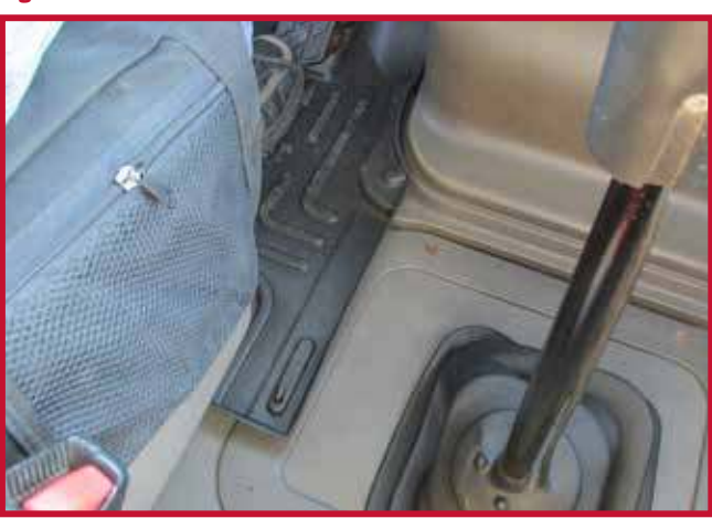
Figure 10 - Driver Mat Hook Installation

Mark the approximate position where the hook needs to be attached to the floor. Once the position is located, remove the driver mat from the truck.