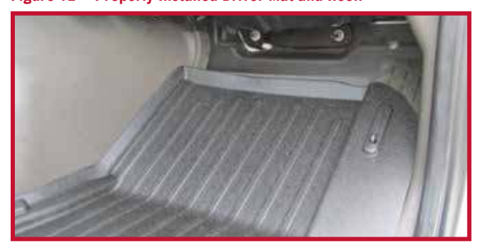
Figure 12 - Properly Installed Driver Mat and Hook

For all other cases install the hook on the dog house trim panel as shown in Figure 13.