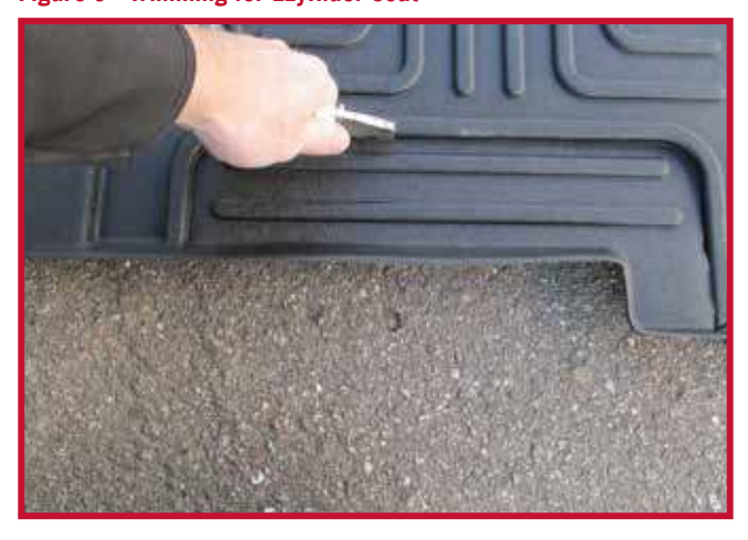
Figure 8 - Trimming for EzyRider Seat

CAUTION: Minimizer floor mats are designed to be used with the factory rubber flooring in good condition. If the factory floor is in poor condition (has humps or bubbles) due to excessive moisture, the floor mat may not sit in place properly. If the floor mat does not sit in place properly there is risk that the floor mat will interfere with the brake and throttle pedals.