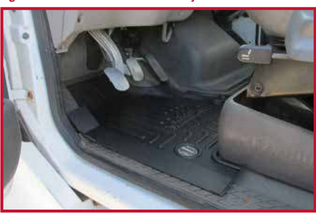
Figure 7 - Driver Mat Installation with EzyRider Seat