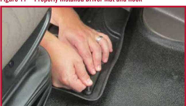
Figure 11 - Properly Installed Driver Mat and Hook