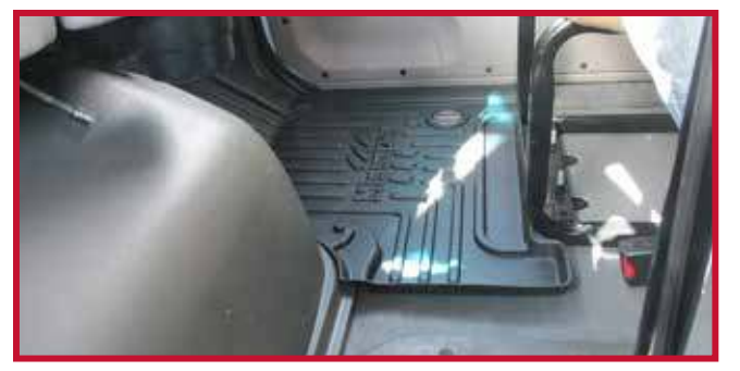
Figure 13 - Passenger Mat Hook Installed on Doghouse Trim

For all other cases install the hook on the dog house trim panel as shown in Figure 13.