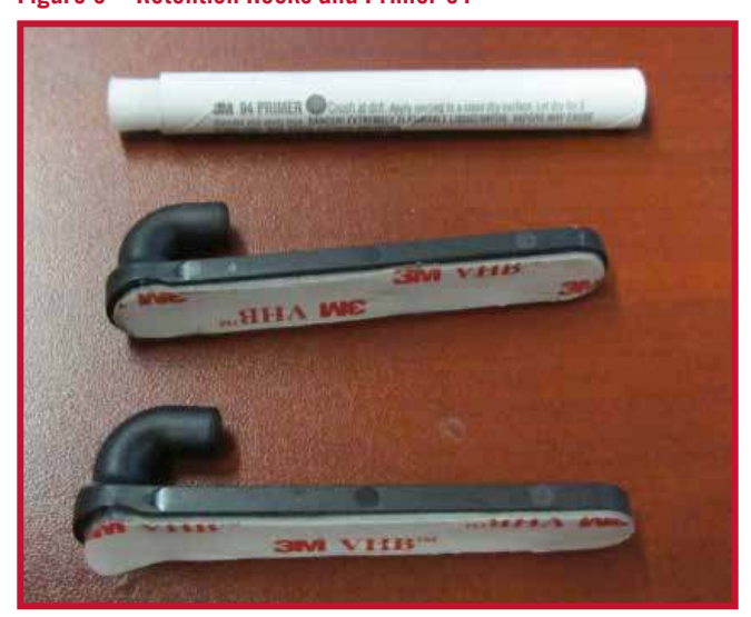
Figure 9 - Retention Hooks and Primer 94

6. Inside the package with the installation instructions, locate two black plastic retention hooks as well as a white tube of Primer 94 as shown in Figure 9.