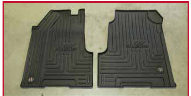
Figure 7 - Kit 103085 Contents