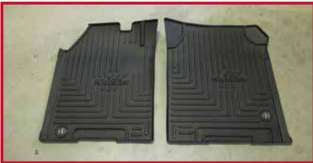
Figure 3 - Kit 103082 Contents