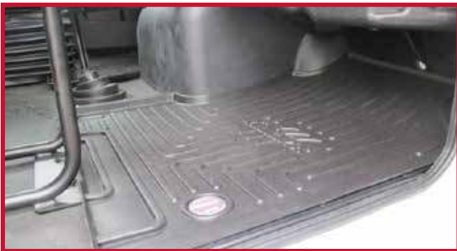
Figure 15 - Passenger Mat in Position

Note: The passenger floor mat is designed to accommodate both fixed seats and suspension seats. Trucks that are equipped with a fixed base passenger seat as shown in Figure 10 will need to be hand trimmed prior to installation. See figure 16 below that shows the green and orange shaded areas. Aftermarket seats may also require hand trimming. There are two raised ribs molded into the passenger mat to act as trim guides. To confirm which line to trim along test fit the mat against the seat base. Use a sharp utility knife to trim along the outside edge of the rib. Preserve the rib for liquid containment.