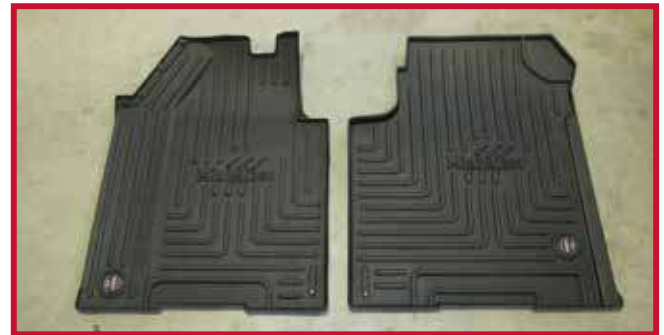
Figure 13 - Driver Mat Hook in Position