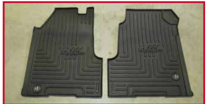
Figure 8 - Kit 103086 Contents