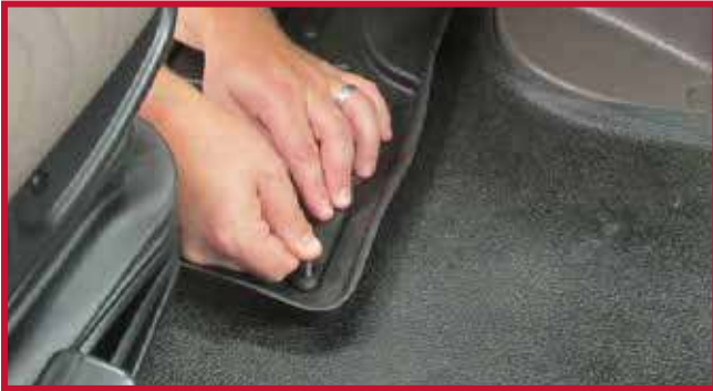
Figure 14 - Apply Pressure to Hook

15. Position the passenger floor mat in the truck. Make sure the passenger mat is pushed all the way forward so the outside lip makes full contact with the doghouse trim panel and fire wall as shown in Figure 15.