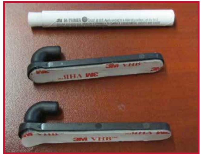
Figure 12 - Retention Hooks and Primer 94