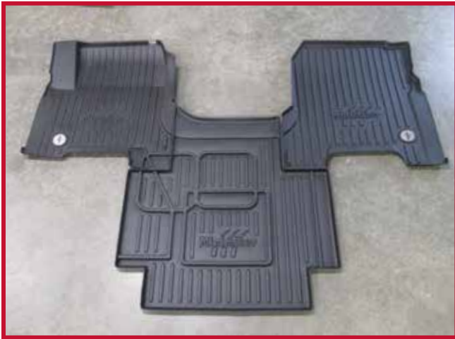
Figure 1 - Floor Mat Kit #104245