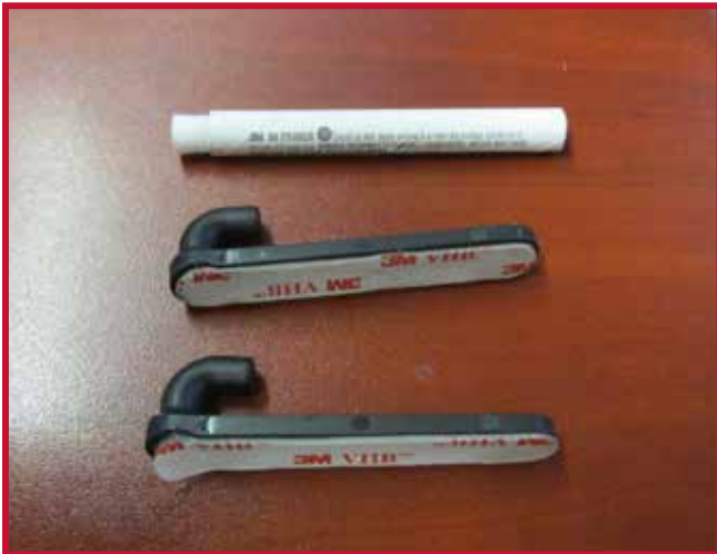
Figure 5 - Retention Hook and Primer 94

8. Insert one hook through the hole at the right edge of the driver mat. The hook should fit flush with the underside of the driver mat.