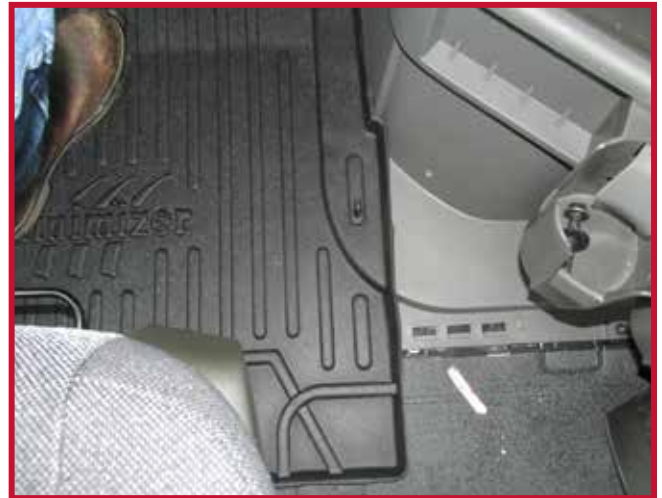
Figure 7 - Driver Mat Hook Installation

18. Pull the driver mat toward the rear of the truck to confirm that the hook is fully engaged into the mat and that the hook is adhered to the molding. If the hook is not functioning properly or the mat cannot be securely installed, do not use a Minimizer floor mat on the driver side of the vehicle.