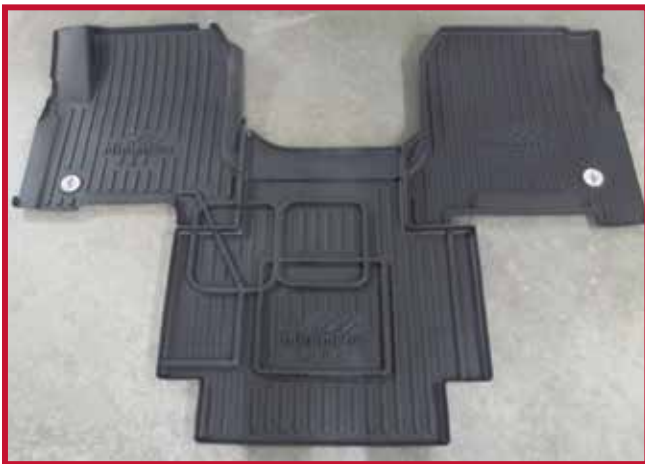
Figure 2 - Floor Mat Kit #104246