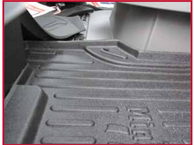
Figure 9 - Passenger Mat Retention Hook Location

23. Prior to operating the vehicle, read the Safety Instructions for Vehicle Operation.