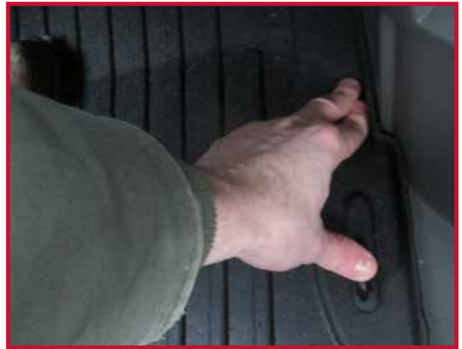
Figure 6 - Apply Pressure to Hook

17. For optimal adhesion do not disturb the hook for a period of 20 minutes after installation. Figure 7 below shows the properly installed driver mat and hook.